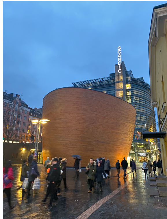
14 Helsinki Chapel of Silence