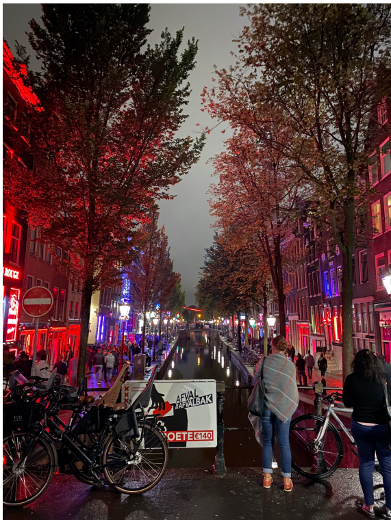
3 Red Light District in Amsterdam (Do remember not to take photos right in front of the buildings)