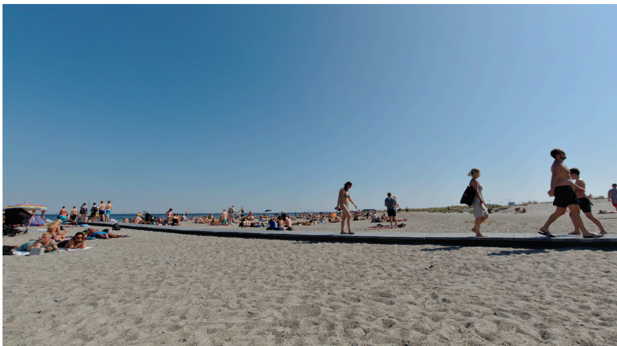
1 Amager Strandpark Beach

I arrived Copenhagen on the 23 rd . My exchange buddy picked me up at the airport and brought me around the campus area at Frederiksberg. I joined the paid Welcoming Package on top of the orientation activities. The canal tour and the Danish Movie Night were definitely the highlights of all the events. During the orientation week, a lot of exchange students go partying every night in the clubs together under the coordination of the student organizing committee. Apart from the welcoming activities, I went to the Amager Strandpark Beach as it was still summer. It was totally worth it with the sunny weather as Copenhagen is always cloudy if not raining during winter time.