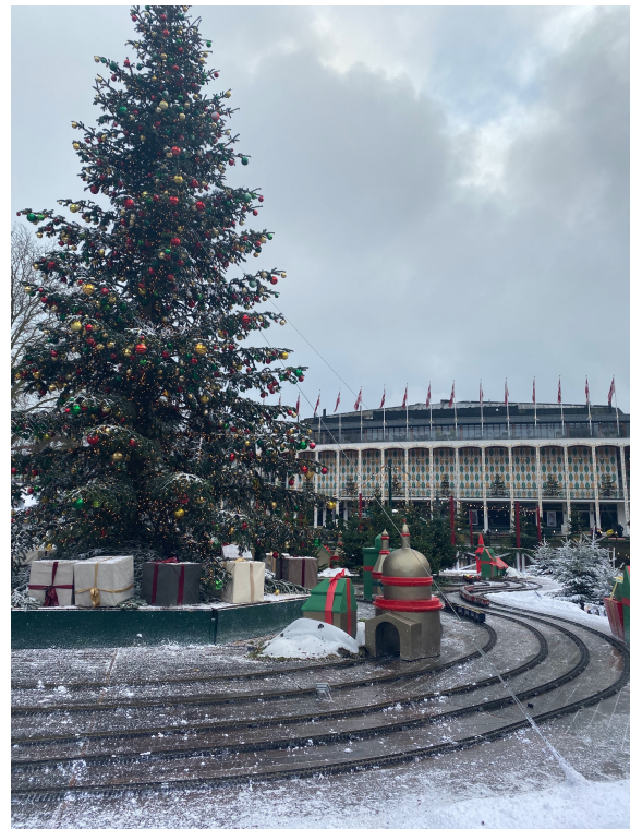
16 Tivoli Garden