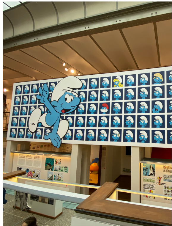
4 Comics Museum in Brussels (worth going for Smurf fans)