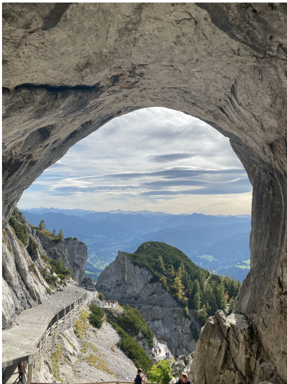
7 Ice cave in Salzburg (The view from the mountain top wowed me more than the ice cave)