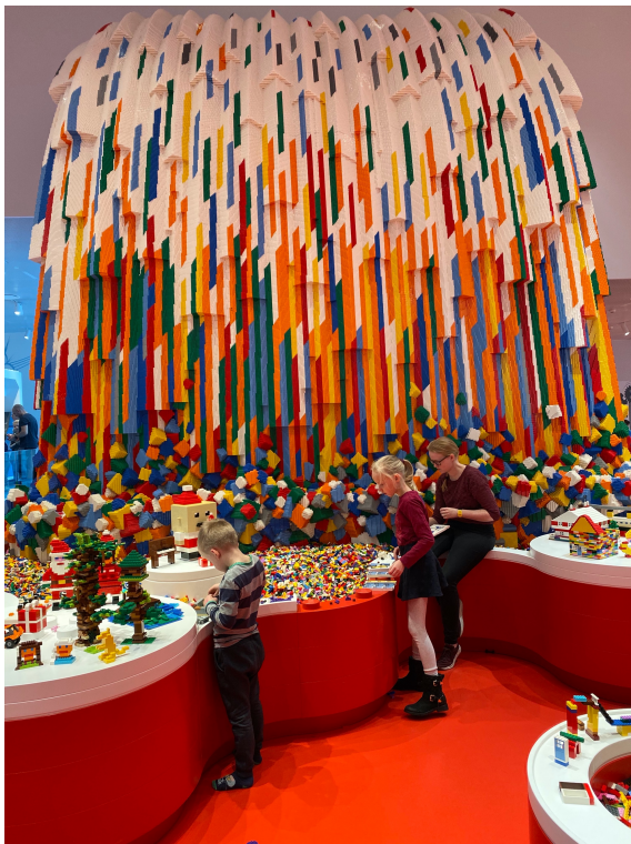
15 Lego House