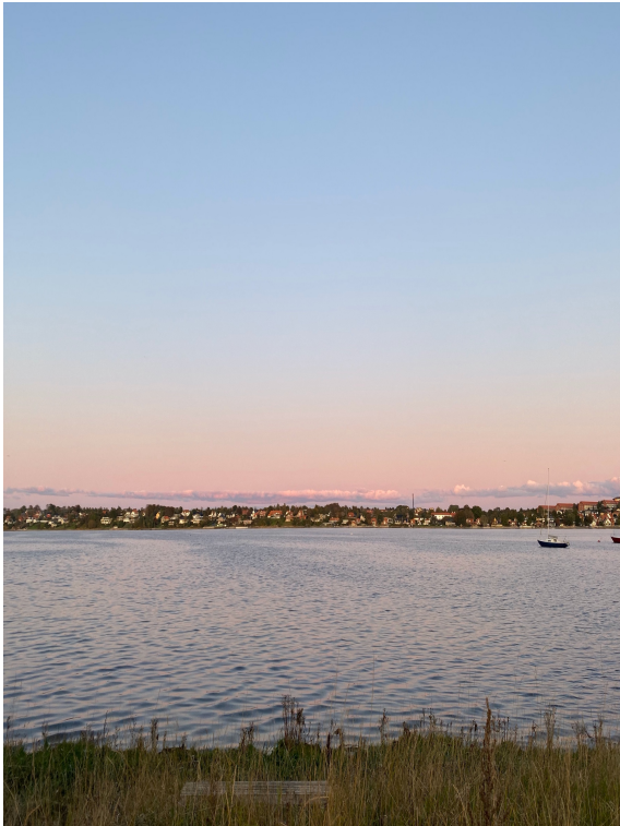
5 The sky was pink during the sunset in Roskilde

exploring Copenhagen and I went to Roskilde, which was a town by the coast with a stunning sunset.