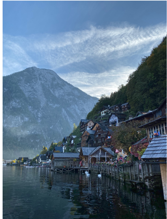
6 Hallstatt in Austria is a must-go although it is pretty packed with tourists