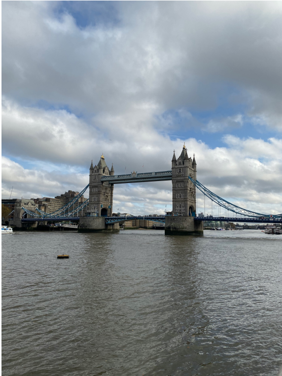
11 Tower Bridge in London