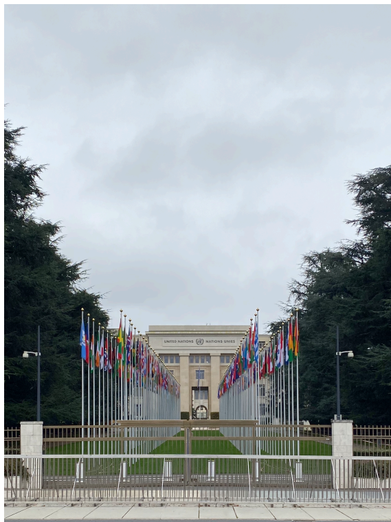
9 United Nations Office in Geneva

I had more classes in November as I was doing 3 semester-long courses and 2 quarter-2 courses. My professors assigned two mid-term take-home assignments and 1 mid-term project to me. Nonetheless, I had 21 days staying out of Denmark due to unexpected arrangements and spontaneous trips on top of what I had planned. Being the president, I represented Oikos Hong Kong to take part in Oikos FutureLab in Geneva together with 2 of my executive committee members. It was an event that gathered the representatives from chapters all around the globe to formulate solutions for a more sustainable future from the business perspective. I had a taste of insect products such as energy bar with insect powder and dried insects, which were unexpectedly tasty. During this trip, I received an invitation from a bank to do a group interview in London for a summer analyst position in Hong Kong in the week after. I also travelled to Ireland and Morocco this month. It was my first time being in Africa and I had a slight cultural shock. The hawkers in the market would spare no means to catch your attention. For instance, they would say “hello” in all Asian languages when they saw me and my friends (who were from Singapore). There were some Moroccan scams and thefts to be aware of. After all, I found the way of how they do business interesting and enjoyed bargaining with the hawkers. Do remember only buy something half the price of what the hawkers quote.