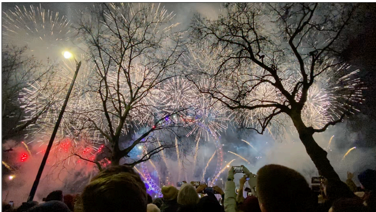
17 London New Year Countdown Fireworks

I went to London again for New Year Countdown. I also spent my time on my final project of the course about financial crises as well as preparing for my Entrepreneurial Finance Final exam. In order to watch the fireworks right next to Thames River, you have to get the ticket in late September online for 10 pounds.