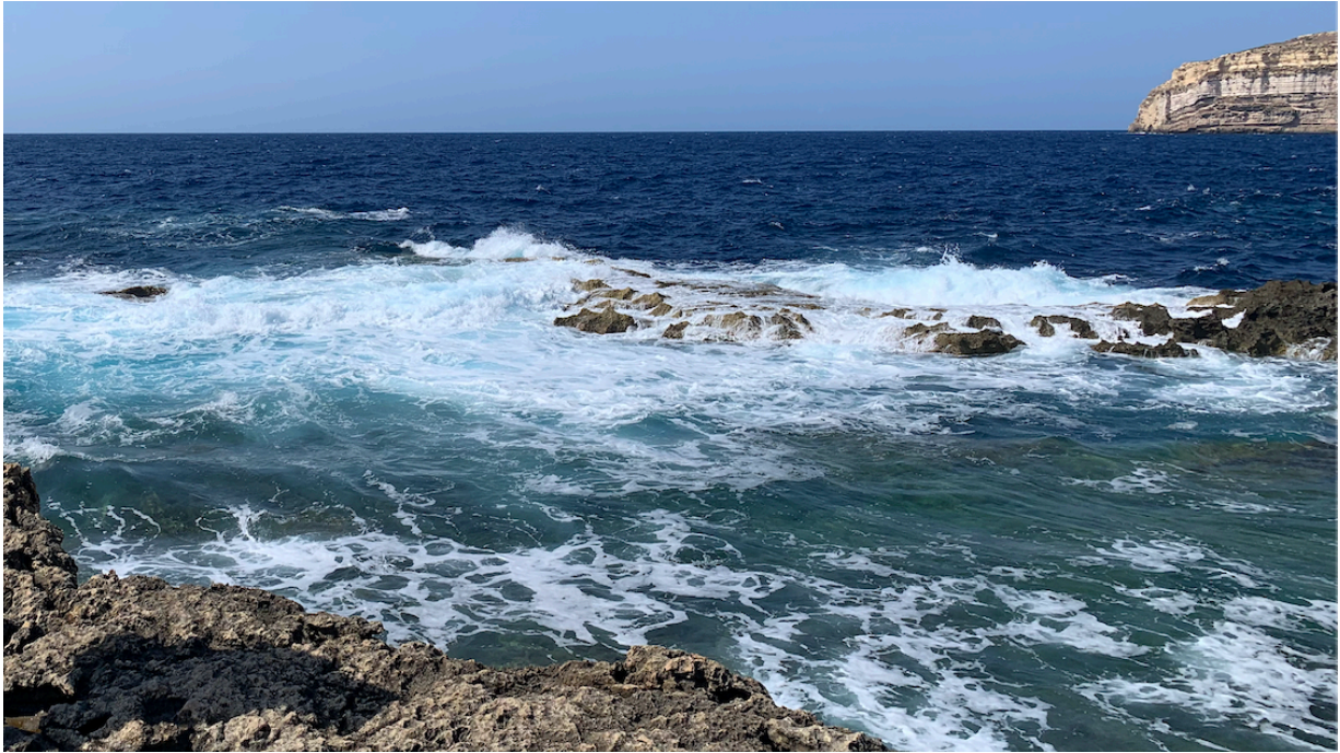
2 Near Blue Grotto in Malta