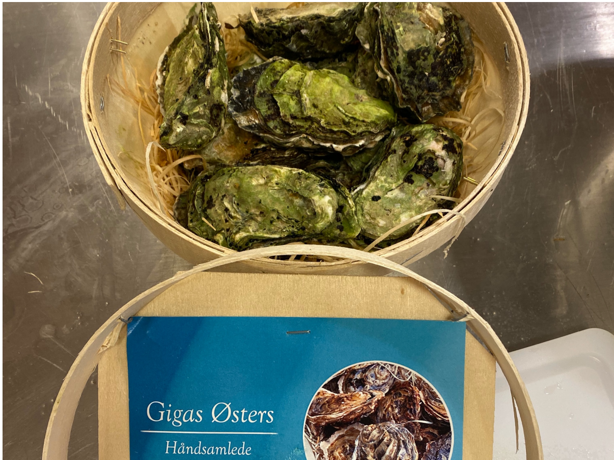
18 My client offered me free oysters as a reward for testing out their seafood pick-up point