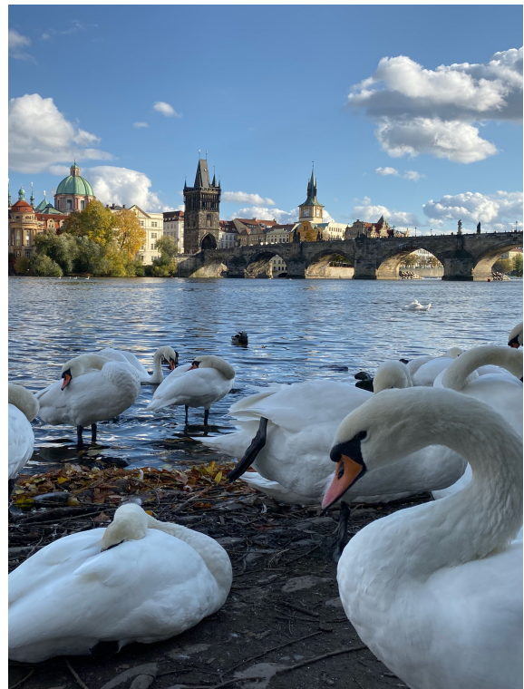
8 Charles Bridge in Prague (there were more swans than tourists)