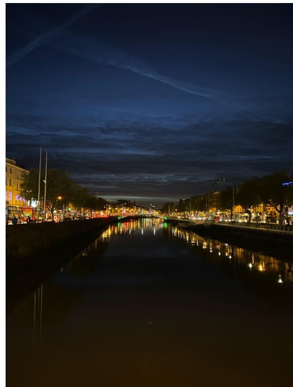
10 River Liffey in Dublin at night